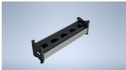
It is also possible to charge up right