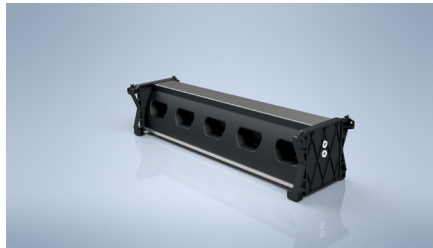
Only use 5WSCC Charger P/N: 7177214 in combination.

Link up to 4 units with the (Optional) Link cable(7177215) connect from output port to second cradle's input port