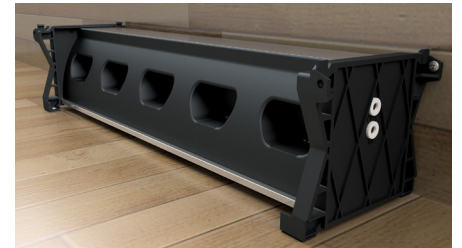
Mount Charging cradle to desk or wall use recommended 4.8mm mounting screws