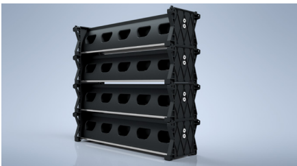
Stackable up to four chargers